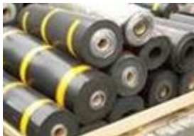
NBR-EPDM Rubber Sheeting

Universal Rubber Sheets are used for jointing between flanges and/or similar joints subjected to pressures of water/air/low pressure steam up to 3.5 kg/cm 2 in steel mills, fertilizer industries, chemical & pharmaceutical plants, food, etc and HIC International Co, India offers solid black color vulcanized sheet possessing excellent physical properties, resistant to air, water, steam & compression set.